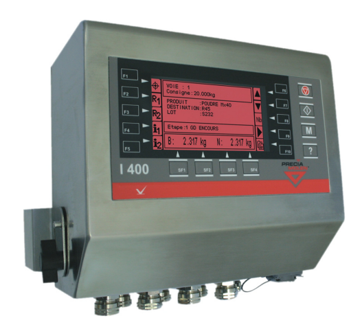
I 400 Terminal